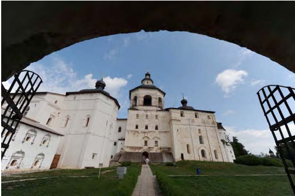
Half Day of Touring